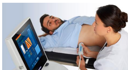
Figure 1: Patient receiving a liver assessment using the FibroScan machine

The FibroScan uses ultrasound technology to measure the speed at which a sound wave returns from your liver. You will need to lie down on your back and raise your right arm so that the FibroScan probe can be placed in a gap between your ribs ( Figure 1 ). This procedure is non-invasive, painless and takes about 10 minutes.